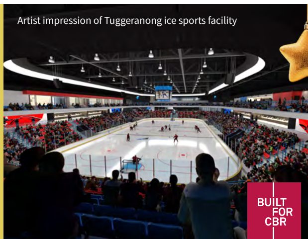
Artist impression of Tuggeranong ice sports facility

There will also be a third rink dedicated to curling – the first of its kind in Australia – plus spectator seating for 3,600 people.