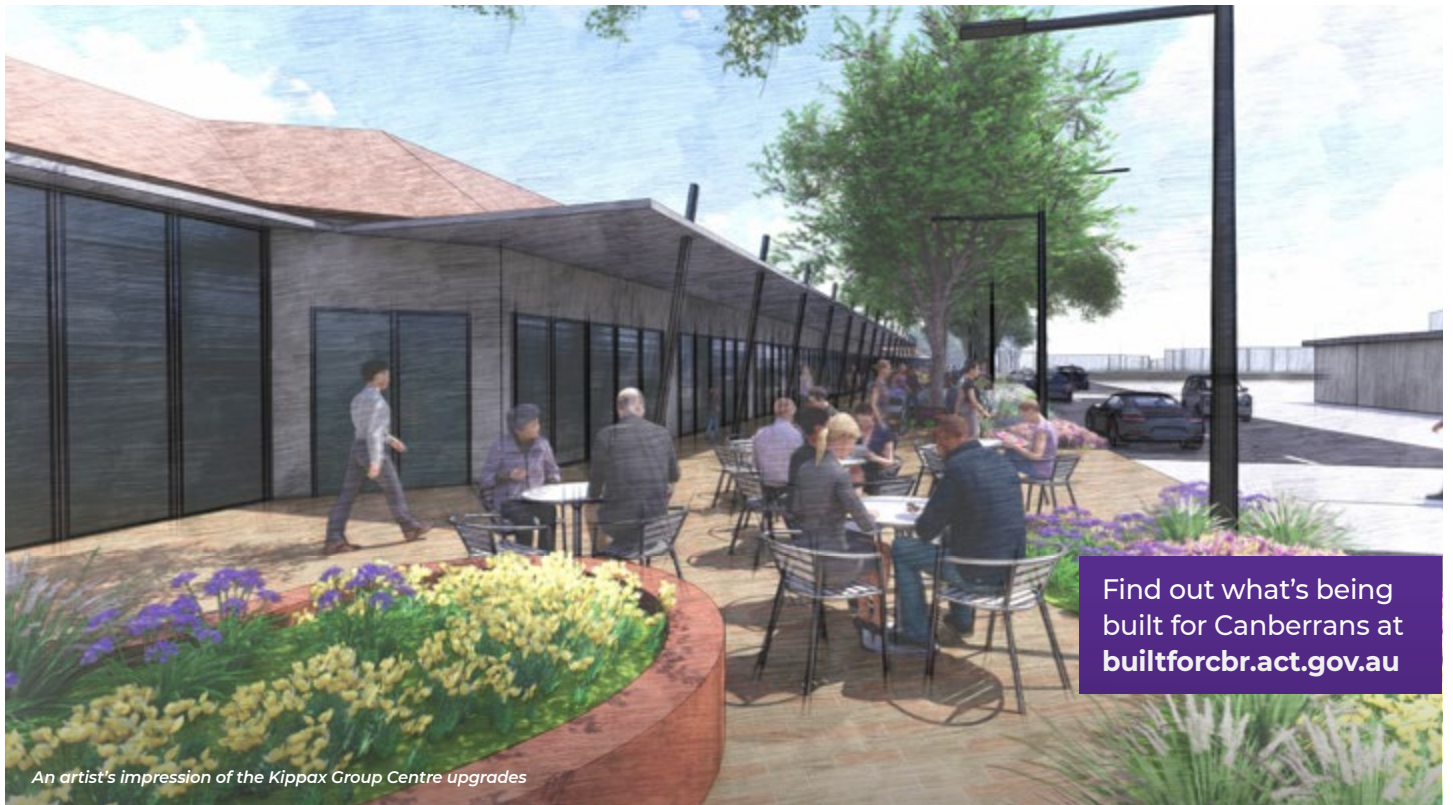
An artist's impression of the Kippax Group Centre upgrades