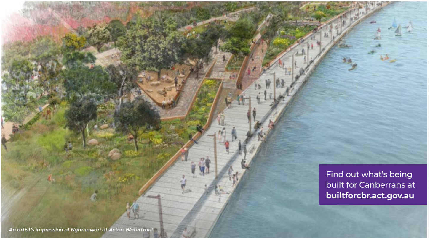
An artist's impression of Ngamawari at Acton Waterfront

Find out what's being built for Canberrans at builtforcbr.act.gov.au