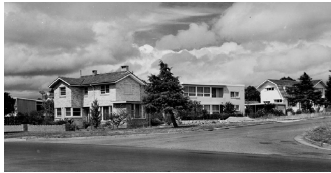
Later photo showing early extensions and alterations