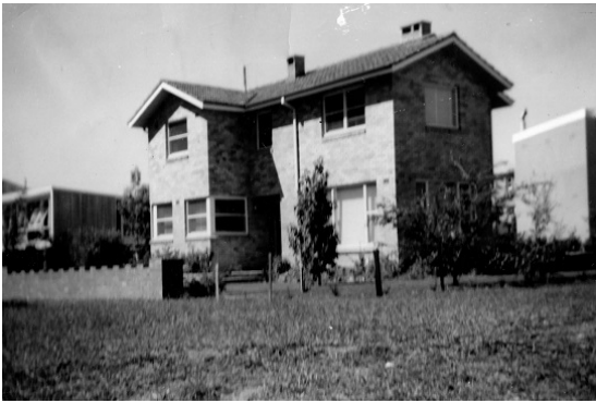
Early photo of original house.