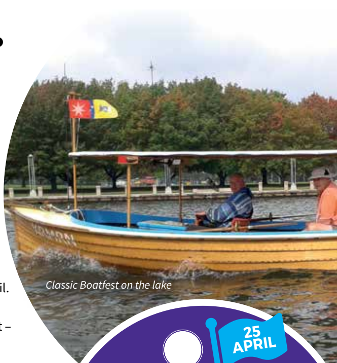
Classic Boatfest on the lake

i For more information visit act.gov.au/heritagefestival