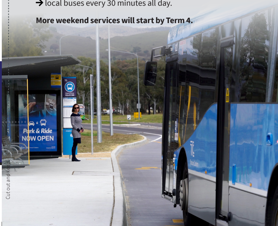
Cut out and keep

More weekend services will start by Term 4.