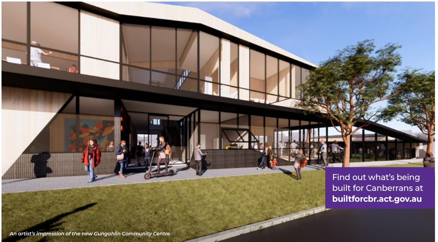
An artist's impression of the new Gungahlin Community Centre

Find out what's being built for Canberrans at builtforcbr.act.gov.au