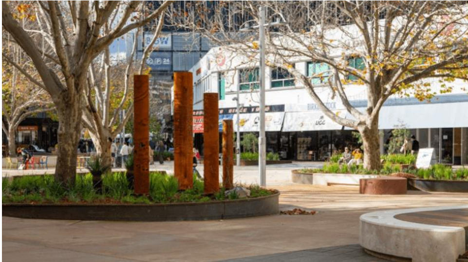
New garden beds and Ngunnawal light poles on City Walk.