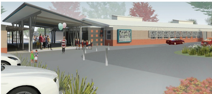
Artist's impression - Coombs Primary School