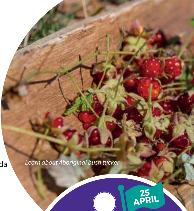
Learn about Aboriginal bush tucker

i For more information visit act.gov.au/heritagefestival