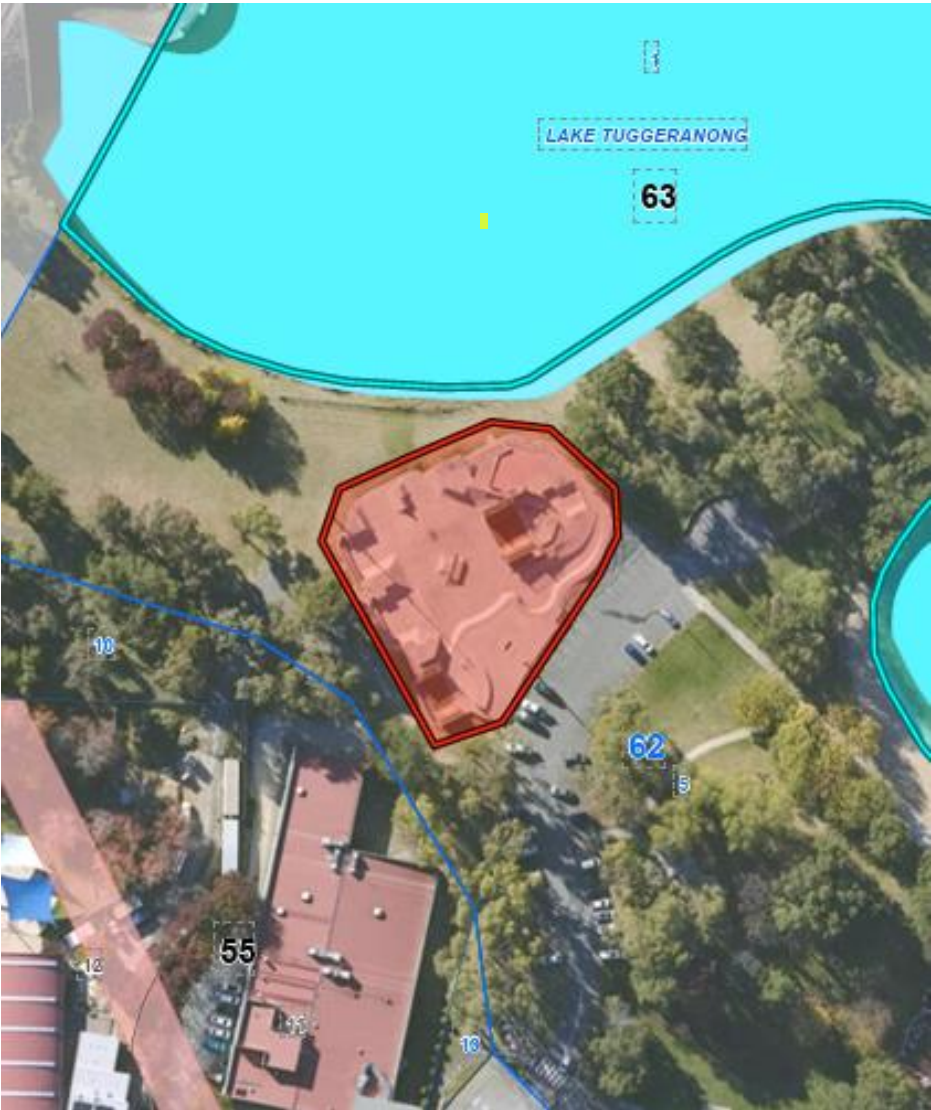
Figure 1: Nomination boundary