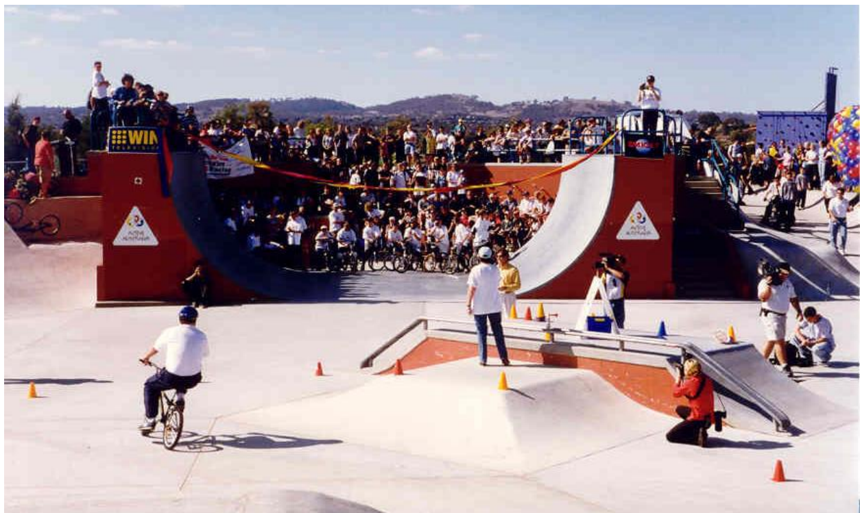
Image 2: The opening of Tuggeranong Skatepark in 1995 was attended by hundreds of local skateboarders and BMX riders (Telfer 2026).

Tuggeranong Skatepark opened in 1995 after an extensive consultation process with its users (Archives ACT 1995). Councils from across Australia had observed the process closely and corresponded with the ACT Government regarding the consultative process and the design it produced.