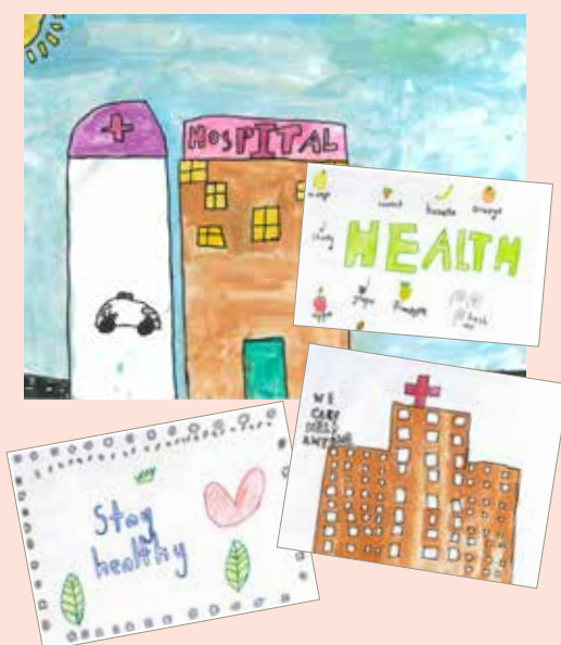
A selection of the local student artwork now on display at the Canberra Hospital Expansion project site.

The works are on display on the corner of Gilmore Crescent and Palmer Street.