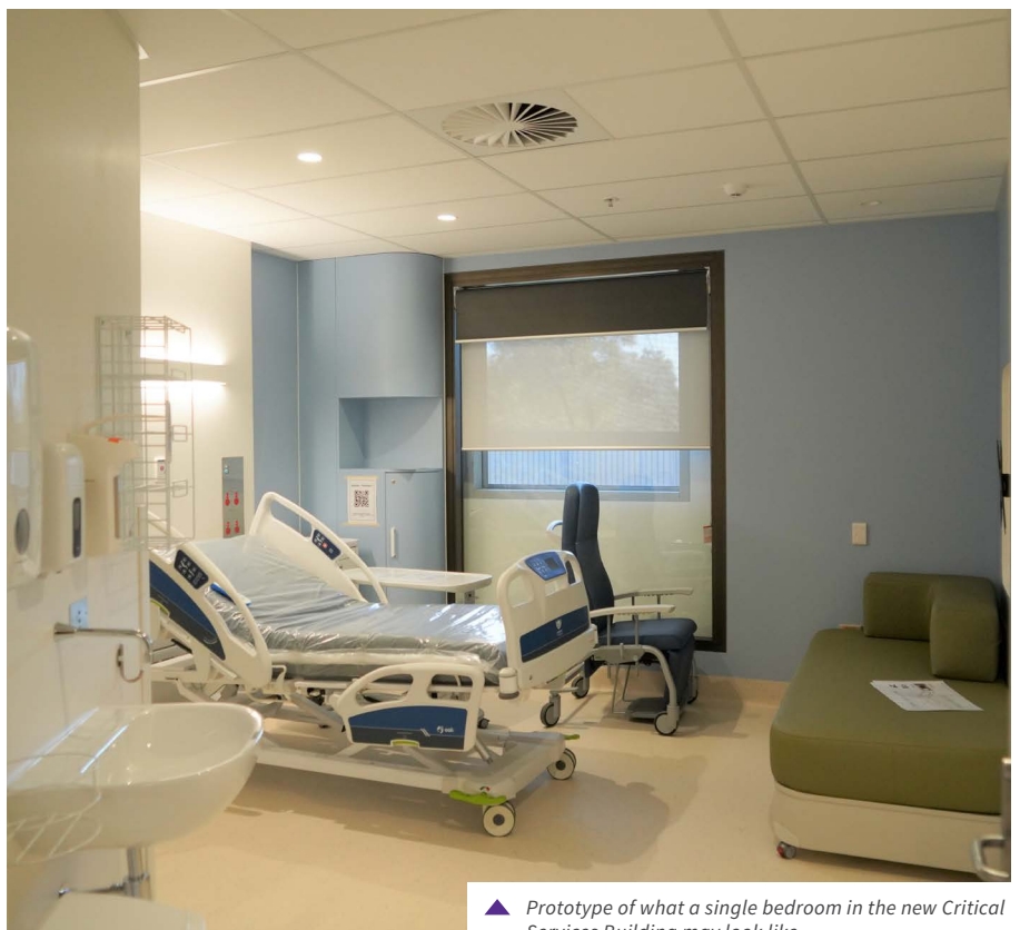
▲ Prototype of what a single bedroom in the new Critical Services Building may look like

The prototype shed has given us a sneak peak of what's to come, and we have completed a visual mock-up of the various façade elements proposed for inclusion in the new building, but we still have a long road ahead of us in terms of activity on site. By the end of this year the building structure will be nearing completion which will give us a real sense of building scale. A bit later on into 2023 is when we will start to get a sense of the interior spaces.