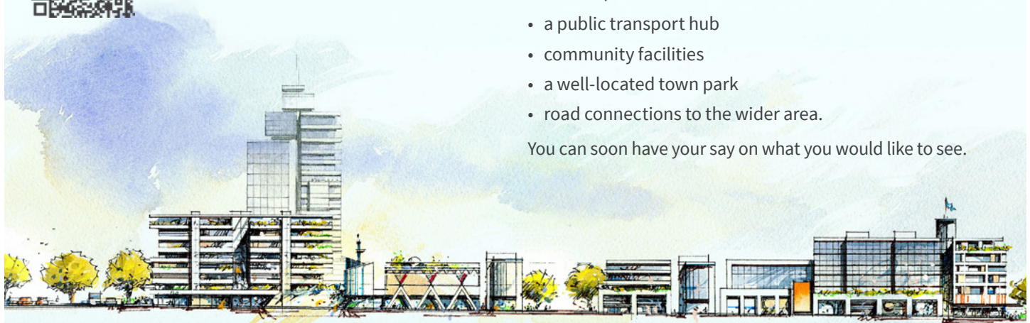
Artist impression illustrating street elevation 1 along Cross Street Central looking north

You can soon have your say on what you would like to see.