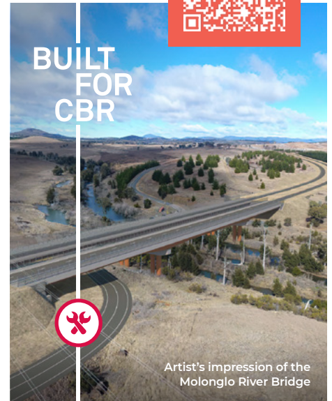
Artist's impression of the Molonglo River Bridge

Improvements to Brierly Street, adjacent to Coleman Court, will soon be complete; with new seating, alfresco dining, lighting and two new raised pedestrian crossings.