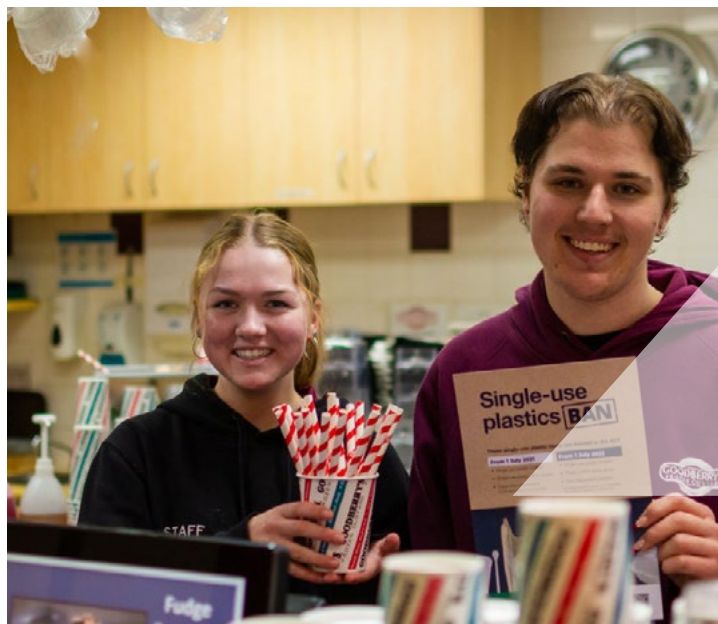
The team at Goodberry's Erindale.