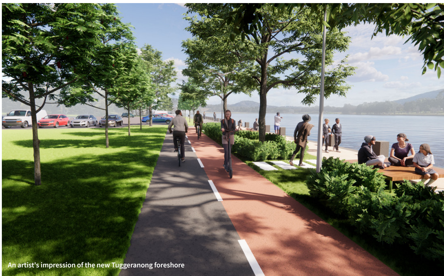
An artist's impression of the new Tuggeranong foreshore