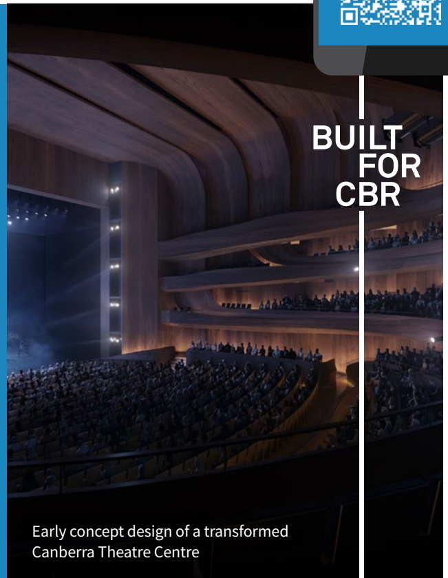
Early concept design of a transformed Canberra Theatre Centre