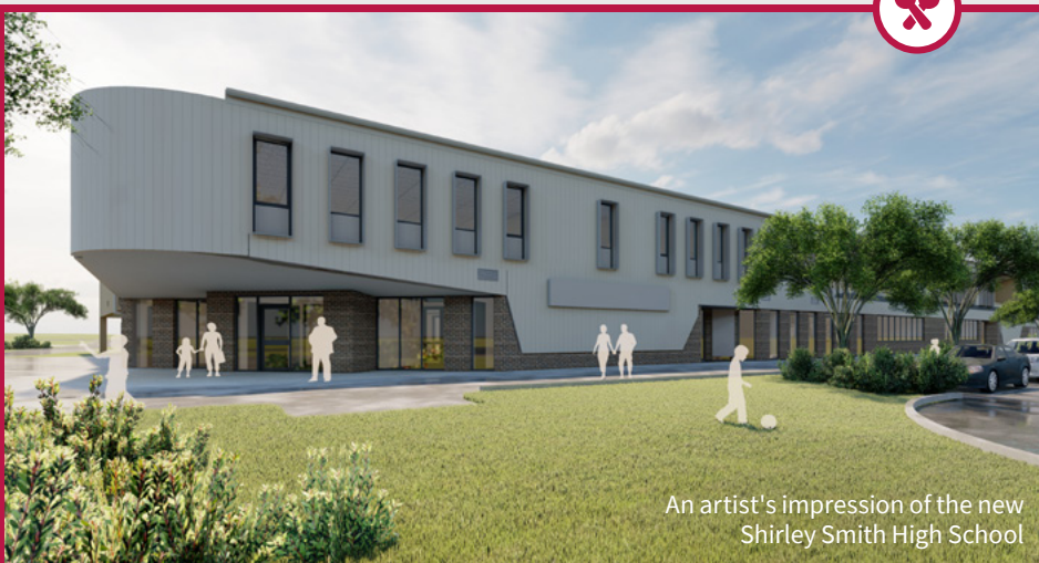
An artist's impression of the new Shirley Smith High School

Dog park visitors are asked to be mindful of changed access arrangements during this time.