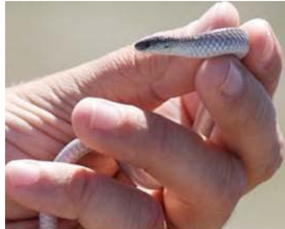
Striped Legless Lizard

grazed, slashed, occasionally burnt and relatively undisturbed. The species occurs in native grassland on the Majura Training Area (MTA) (Department of Defence land), which is managed for conservation and is generally only lightly grazed by kangaroos. Delma impar has also been recorded in the Airport Services Beacon paddock, a fenced area of about 10 ha that is contiguous with habitat on the MTA and which has not been grazed for at least three decades. In contrast, D. impar has not been detected in the adjoining native grassland on Canberra Airport, which is subject to a slashing regime to maintain a moderately short (10 cm high) grass sward. The grassland at Majura West is grazed by kangaroos and in the past has been grazed by sheep. The Woolshed Creek grassland (adjacent to the Majura Parkway) is part of a grazing lease and is subject to grazing by stock and kangaroos.