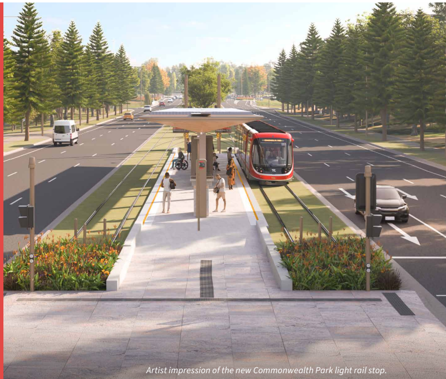
Artist impression of the new Commonwealth Park light rail stop.

An Environmental Assessment (EA) has been prepared for Stage 2A as part of the project's planning and works approval process. This fact sheet outlines the benefits, impacts and assistance to businesses in the area.