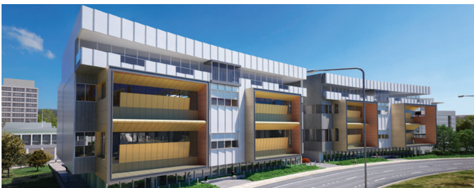
Artist's impression - City Hill exterior view

Or for more information visit apps.treasury.act.gov.au