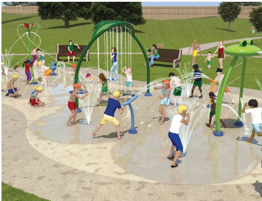
There's a new outdoor water play park for the kids at the Lakeside Leisure Centre.