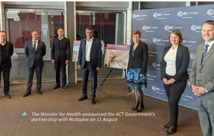
▲ The Minister for Health announced the ACT Government's partnership with Multiplex on 11 August