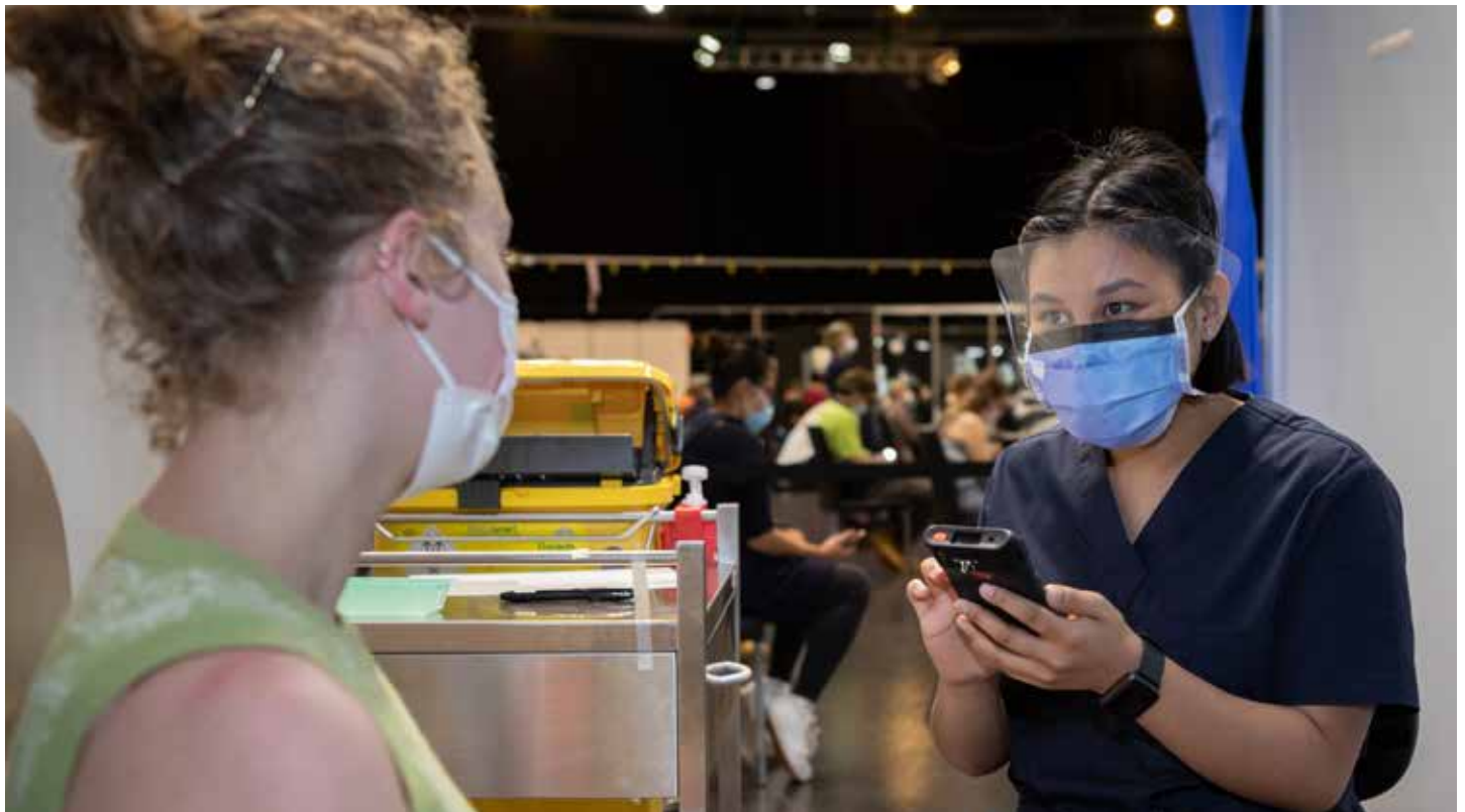
The vaccination centre at the AIS Arena is ready to deliver more COVID-19 booster vaccinations to Canberrans.