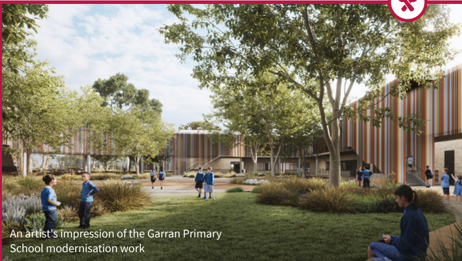
An artist's impression of the Garran Primary School modernisation work