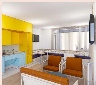
Artist impression of family lounge

The Family Lounges have a shared kitchenette for families to access tea and coffee, dining tables, lounges and televisions, in dedicated spaces away from the patient bedside.