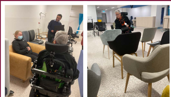
Furniture testing at the Prototype Shed