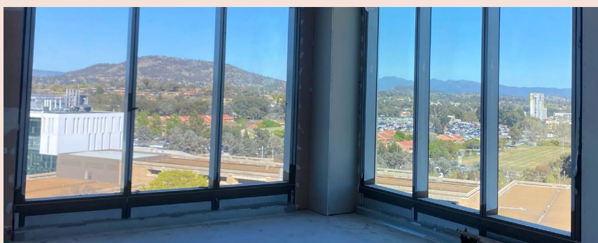
View looking towards the Brindabella Ranges from one of the family lounges

The use of colours extends to the staff stations for easy identification of the unit. Each station features distinctive ceiling colour for easy identification.