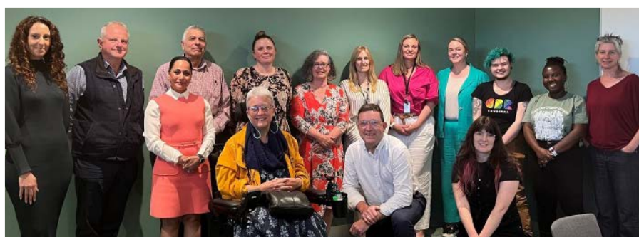
A selection of CRG participants