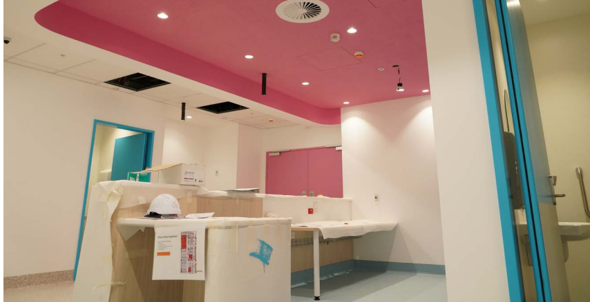
Future short term care staff station under construction and aqua blue wayfinding to patient bathrooms.