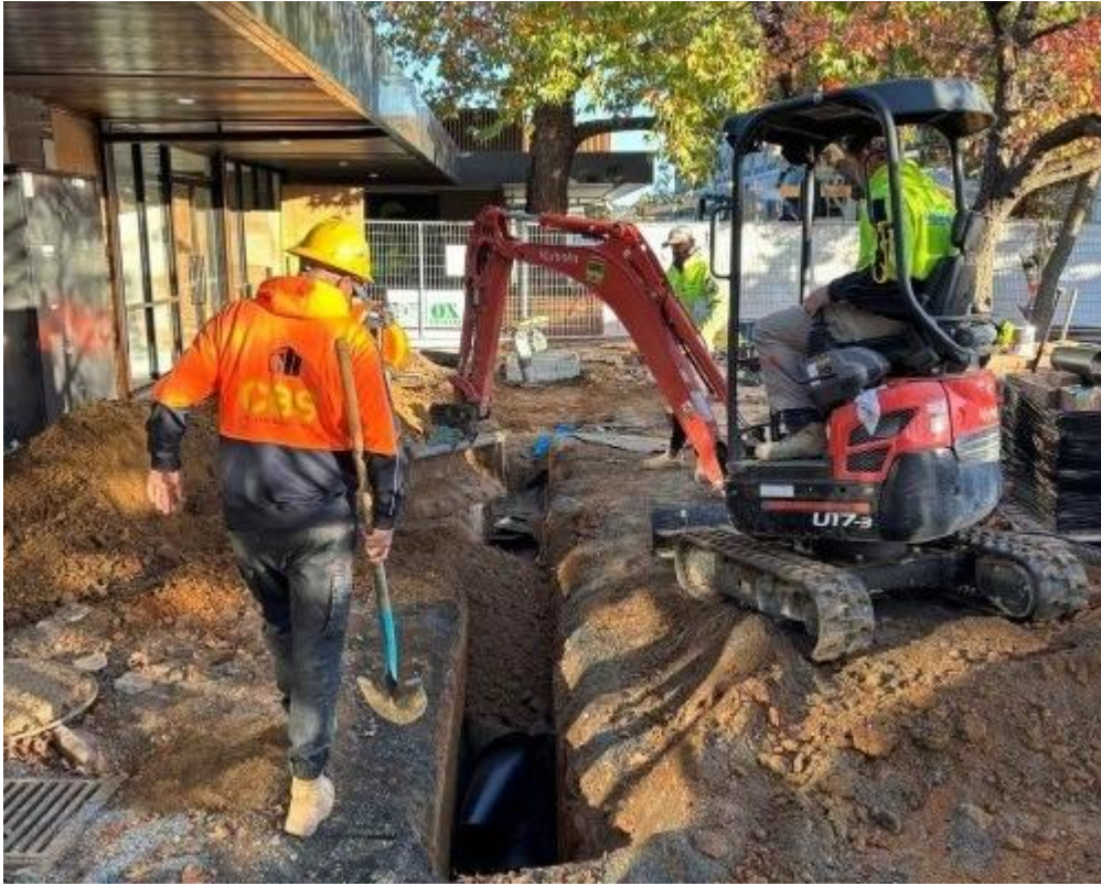
Laying of the new stormwater system in Taglietti Square.

For information about the stages, please see the staging diagram below.