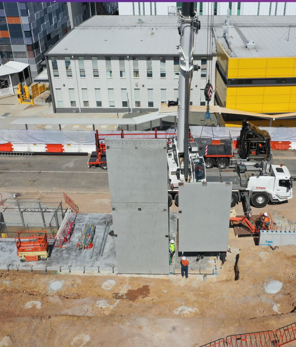
▲ Installation of Building 8's first structure panels in November.

The new facility is set to open in the first half of 2021 and is one of many improvements being made to health infrastructure across the hospital campus. The construction of Building 8 is supporting local industry as part of the ACT Government's economic recovery plan with the project creating more than 100 local jobs and only engaging locally owned subcontractors to date.