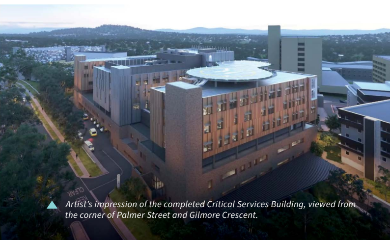
▲ Artist's impression of the completed Critical Services Building, viewed from the corner of Palmer Street and Gilmore Crescent.