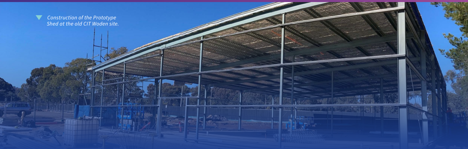
▼ Construction of the Prototype Shed at the old CIT Woden site.

To those who contributed, thank you for your feedback and guidance on this very important project for the future of Canberra's healthcare.