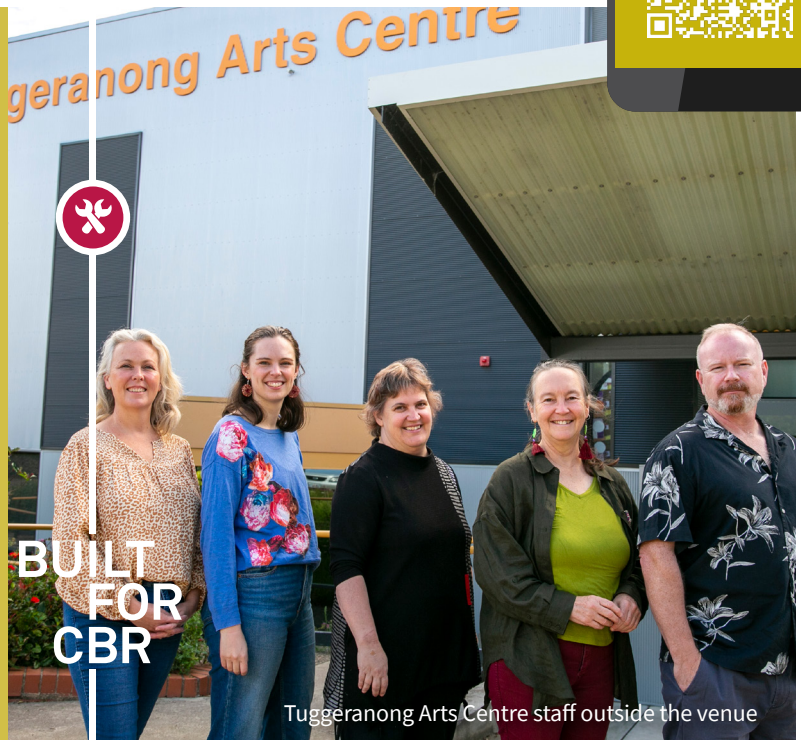
Tuggeranong Arts Centre staff outside the venue

It will also provide spaces for the community to experience art within facilities that are inclusive and fit for purpose.