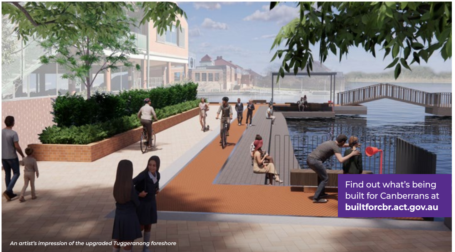
An artist's impression of the upgraded Tuggeranong foreshore

Find out what's being built for Canberrans at builtforcbr.act.gov.au