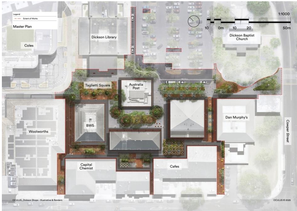
Dickson Shops upgrade project area.